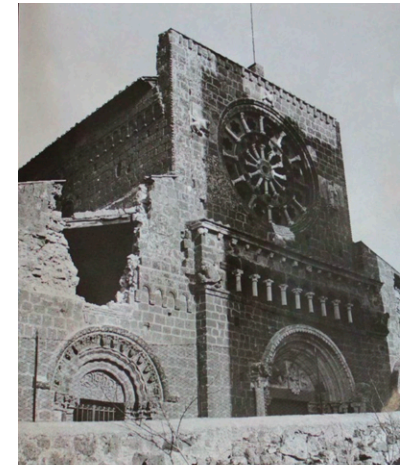
After 1971 Earthquake